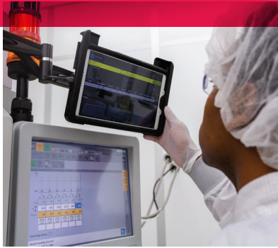
Full quality-control processing